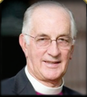
The Rt Revd Dr Peter Carnley AC Primate of the Anglican Church of Australia (2000–2005) Anglican co-chair ARCIC II (2003)